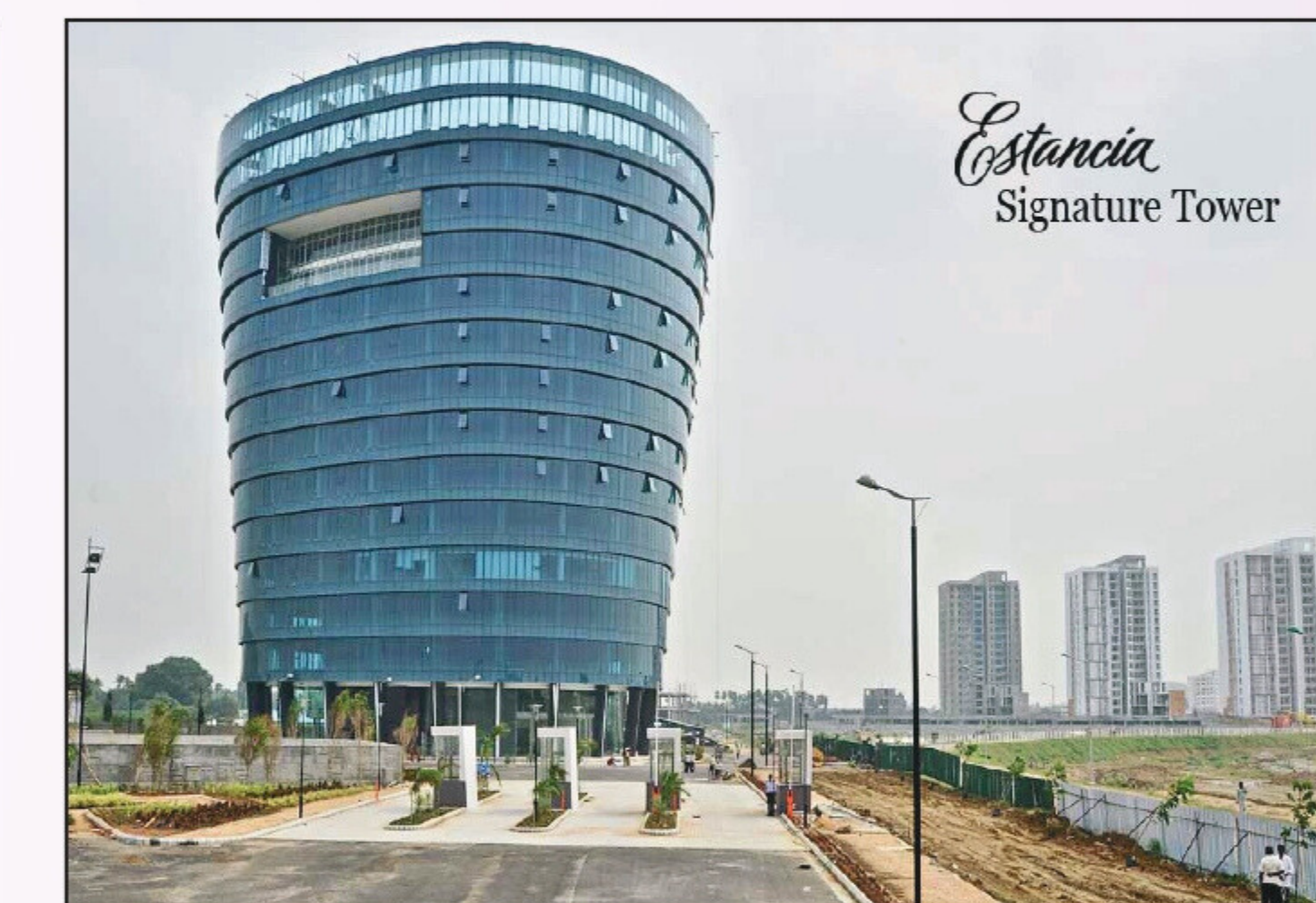
L&T ESTANCIA SEZ