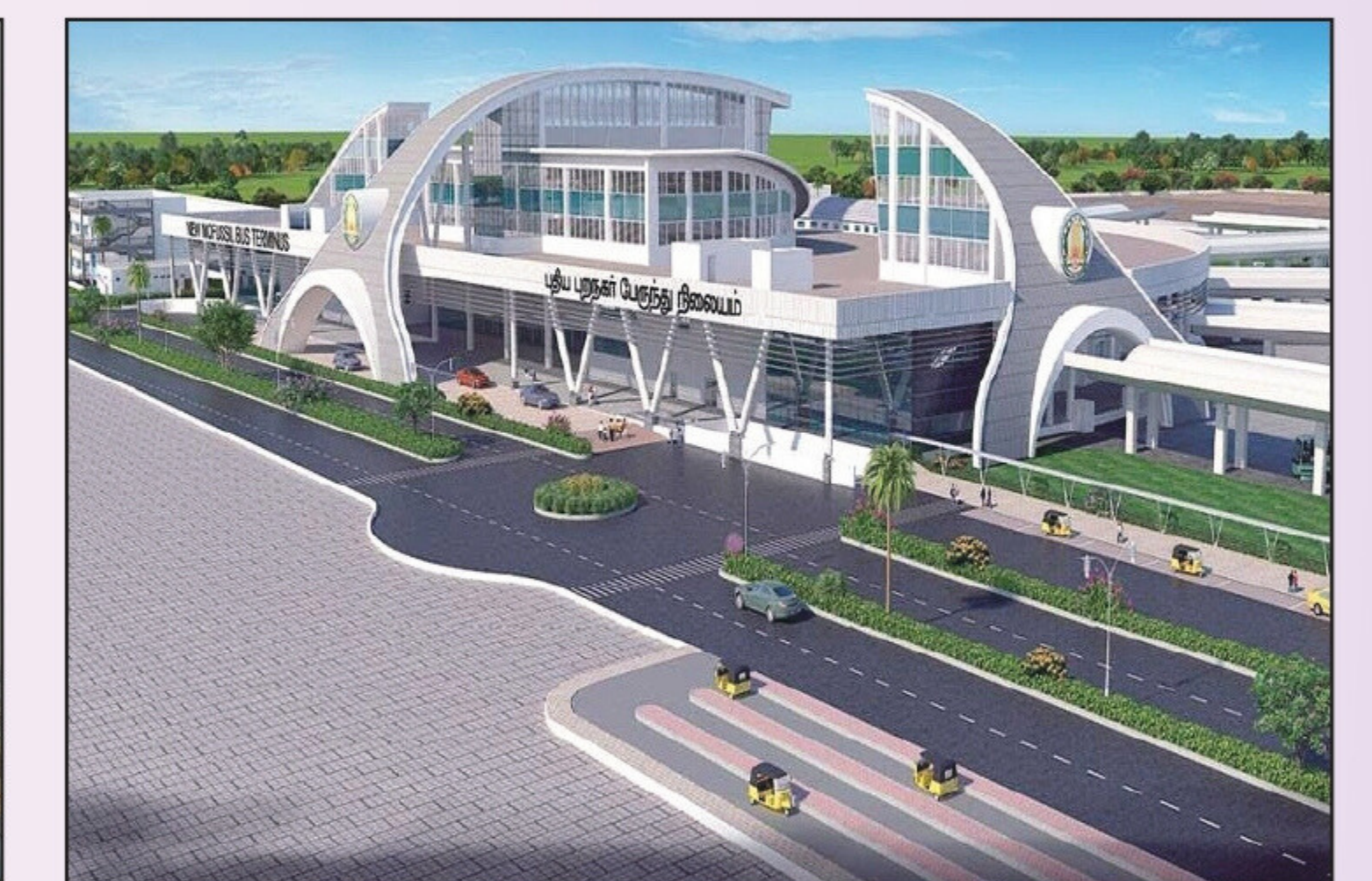
NEW BUS TERMINUS (KILAMBAKKAM)