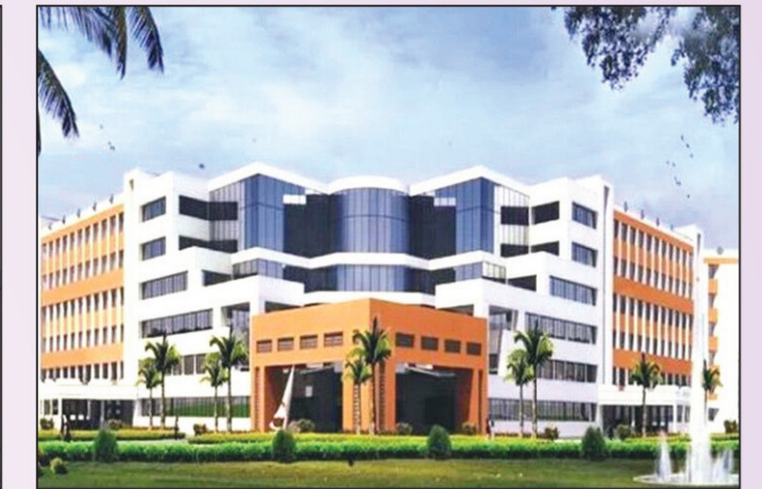
Shri Satyasai Medical College & Hospital