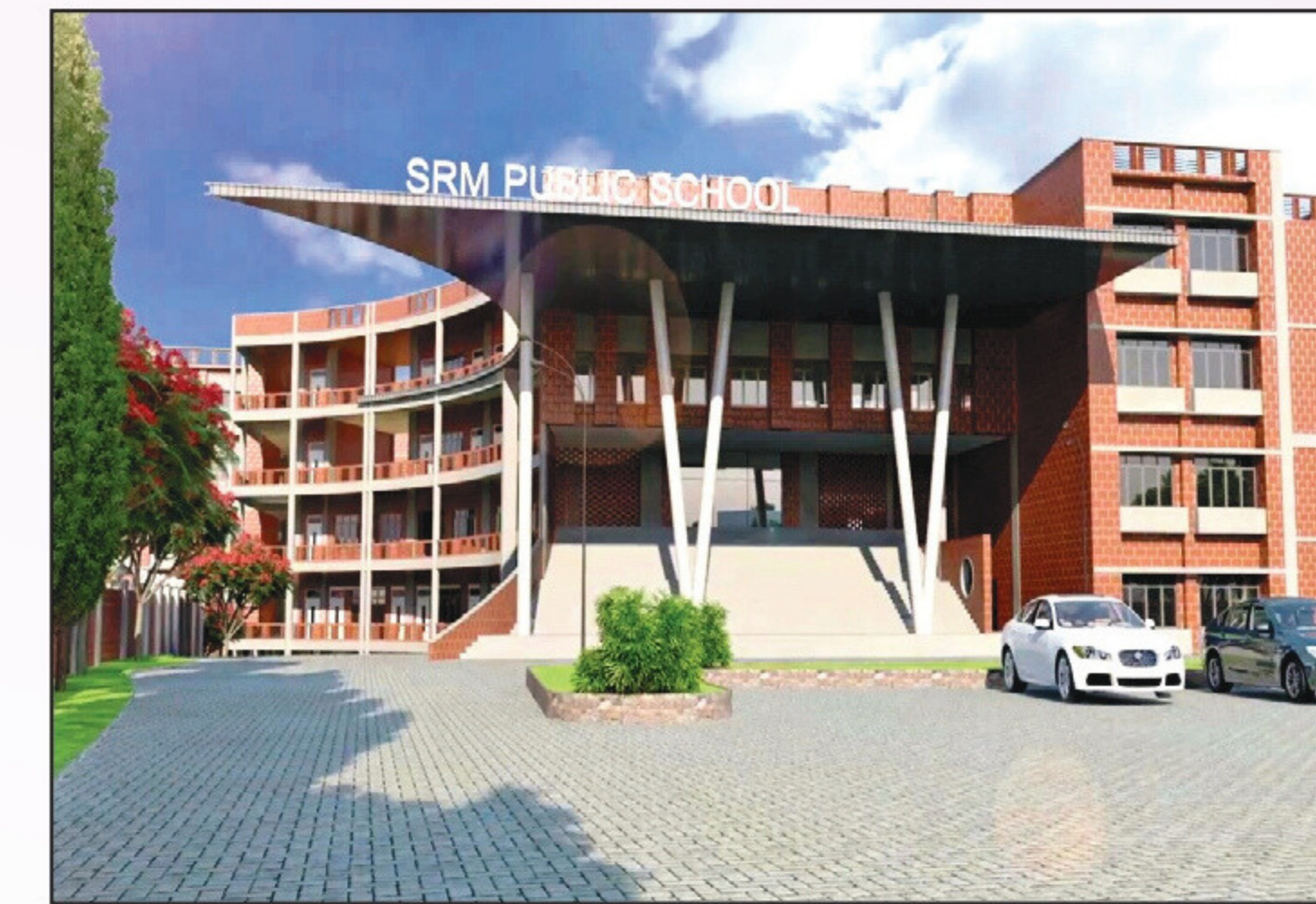
SRM Public School

A prime DTCP residential layout are developed in a Hot spot location @ Guduvanchery . ONE PATH Housing and Properties CENTURY PARK is a prominent place for building your own villas and private homes with an additional advantage of investing your savings in heart of the town. It is spread over 3 acres 77 cent with a total of 105 beautiful plots, 1 Shop & 1 Park ranging from 630 sq.ft. to 2948 sq.ft. Guduvanchery is one of the fastest growing residential hub in Chennai.