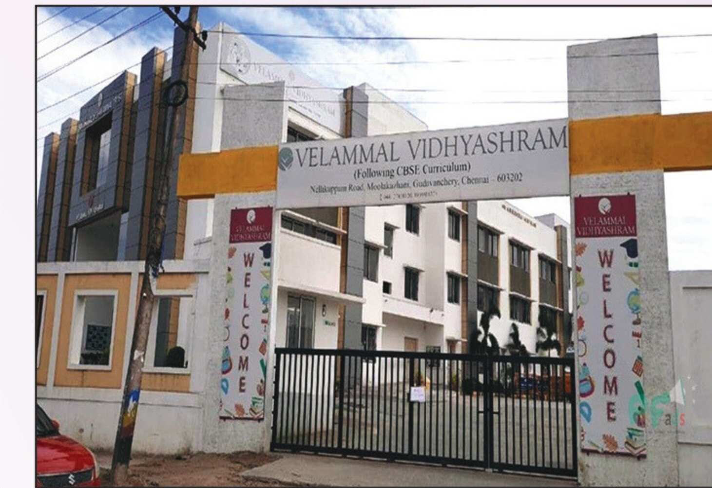
Vellamal CBSC School