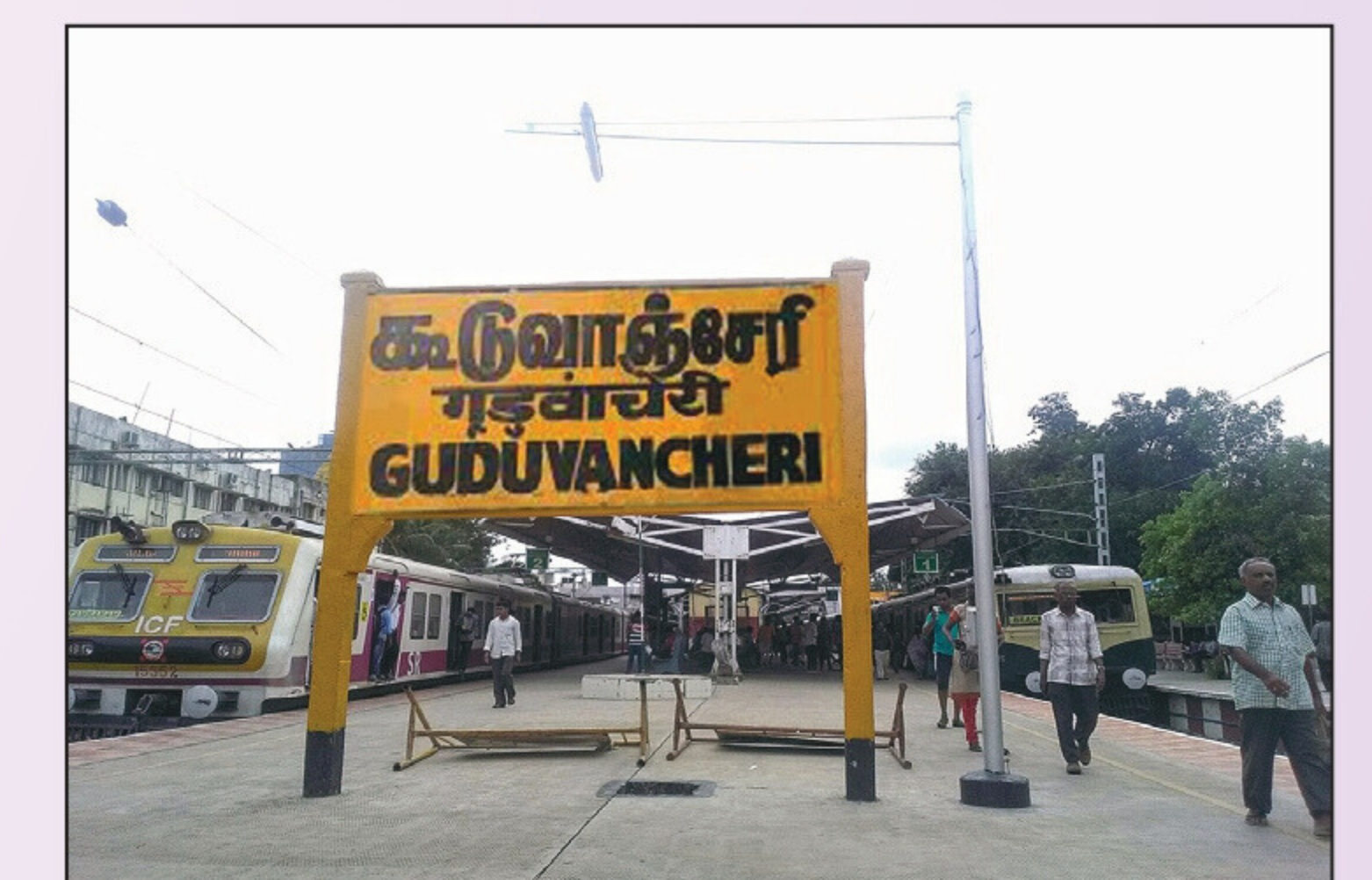
GUDUVANCHERI RLY. STATION